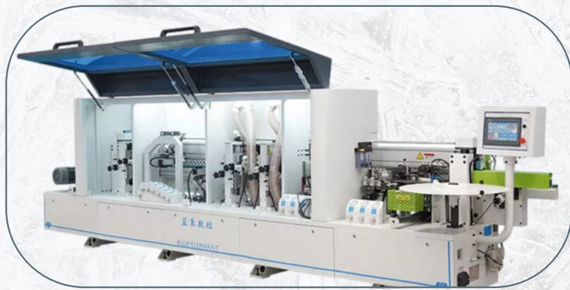
Automatic Edge Banding Machine

machine can realize multiple functions in edge banding process automatically and quickly. For example, pre-milling, edge banding, end cutting, rough and fine trimming, tracking and trimming, scraping, polishing, etc. It is an upgraded edge banding machine for cabinet and other wood furniture making.