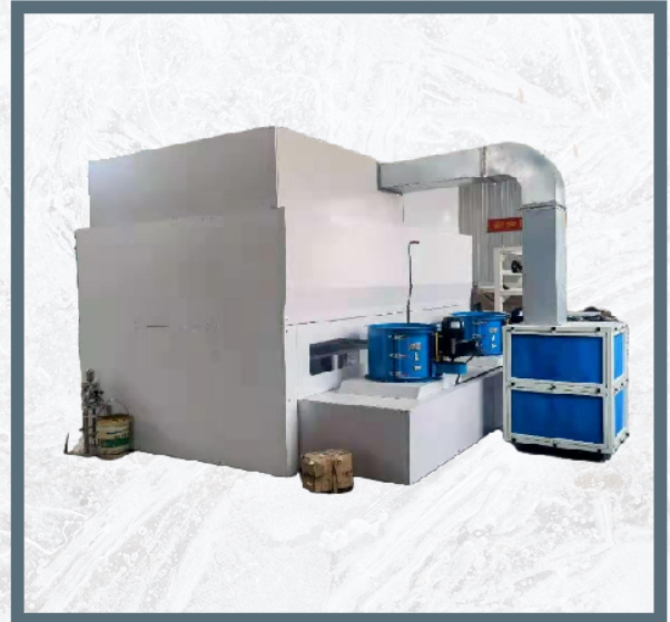
Automatic Spray Paint Machine

Wooden door, furniture and decoration, cabinet Making, wood crafts making, redwood carving.