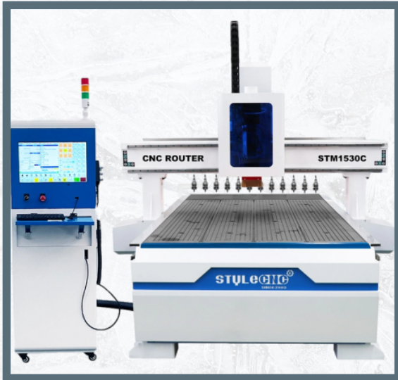
CNC Wood Router Machine

Wooden door, furniture and decoration, cabinet Making, wood crafts making, redwood carving.