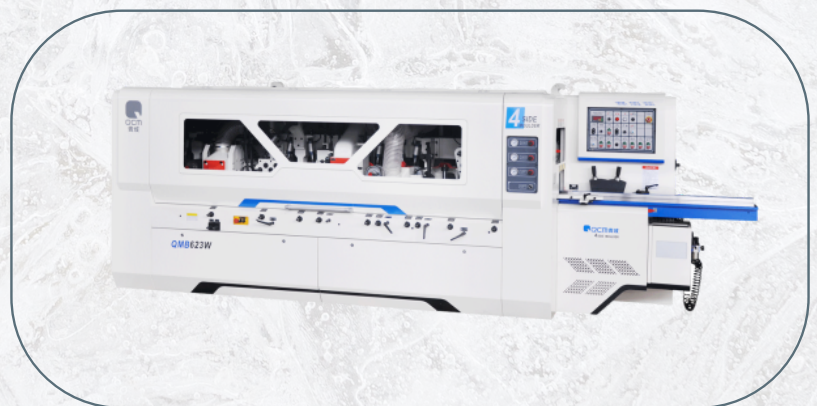
Four side molder, planer, thicknesser machine

This machine adopts the most advanced design and frame structure, designed to replace the functionality of 3 machines. It is widely used in processing door frames, window frames.