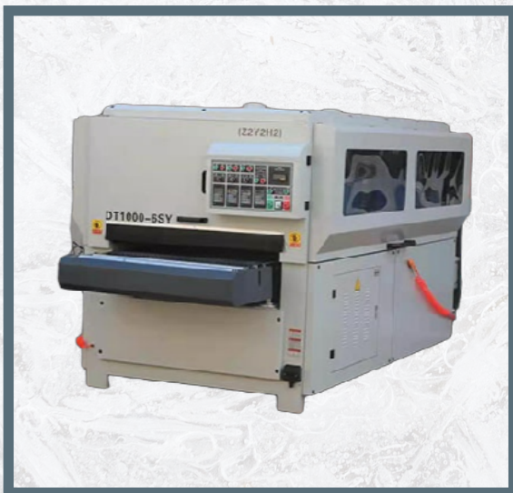
Automatic Sanding Machine

Automatic Furniture Painting Machine enables fast, high quality and economical painting of products such as wood, glass, plastic, metal, fiber. It allows you to obtain smoother surfaces thanks to its water-filtered exhaust system. Spraying Color Stain, Sealer, Primer, topcoat for wood door, kitchen cabinet door & body panel, Closet, bathroom furniture, and other raised or flat panel work pieces.